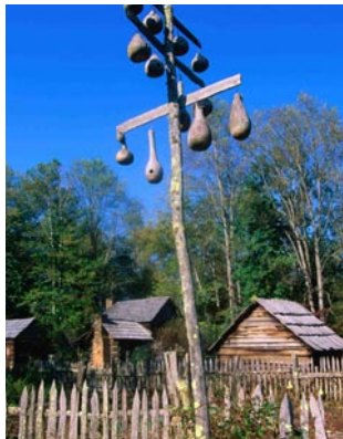
JOHN ELK III