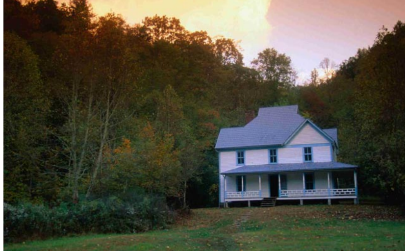
JOHN ELK III